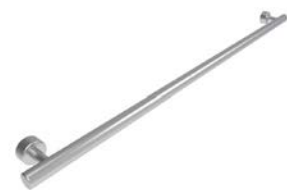
Post and Rail Brushed Stainless

Discuss these possibilities with your sales representative.