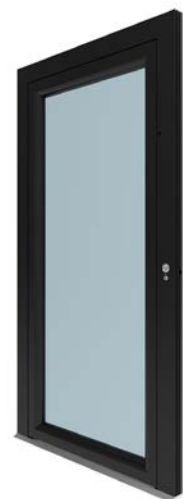
Powder Coated Swing door with translucent glass