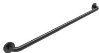
Return Handrail Powder Coated