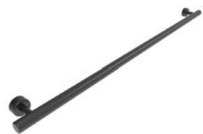
Post and Rail Powder Coated