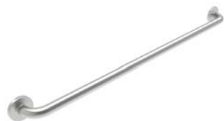
Return Handrail Brushed Stainless