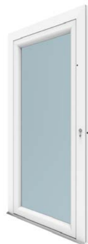
Powder Coated Swing door with translucent glass